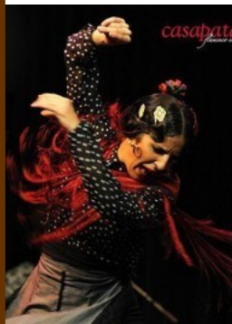
casabat Tablao Flamenco, the Flamenco Dance, Song and Guitar