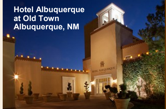
Hotel Albuquerque at Old Town Albuquerque, NM

The hotel embraces the state's blend of Native American, Spanish and Western aesthetics. A portion of your room rate is donated to Cultural Partners to ensure the unique cultural heritage is preserved.