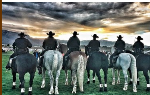
Albuquerque Mounted Police